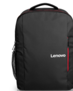
Lenovo 16" Laptop Everyday Backpack B510 4X41U80414