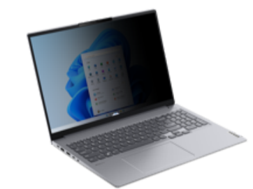
Lenovo 16" Clarity Privacy Filter 4XJ1U03940