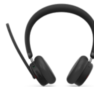
Lenovo Dual-Mode Wireless ANC Headset 6550 (USB-C, Teams) 4XD1S19778