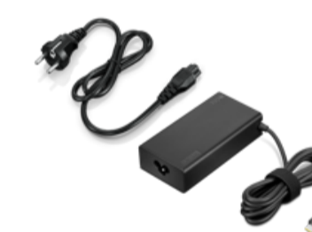
Lenovo USB-C 100W AC Adapter-EU GX21V43585