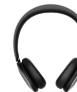
ThinkPad Dual-Mode Wireless ANC Foldable Headset 8550 (Aura Edition) - USB-A, ... 4XD1V23301