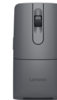
ThinkPad Bluetooth Presenter Mouse (Aura Edition) 4Y51T62792