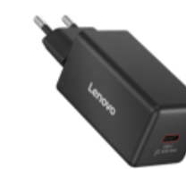
Lenovo 65W Mini USB-C GaN Charger GOA665WBEU