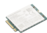
ThinkPad Rolling Wireless RW101R-GL SDX12 4G USB M.2 3042 module for CS2627 4XC1V64418