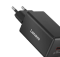
Lenovo 65W Mini USB-C GaN Charger GOA665WBEU