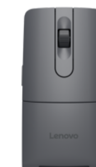
ThinkPad Bluetooth Presenter Mouse (Aura Edition) 4Y51T62792