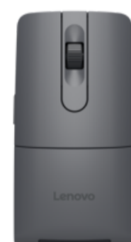
ThinkPad Bluetooth Presenter Mouse (Aura Edition)