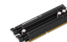
ThinkStation PCIe x16 to 2 PCIe x8 Riser Card