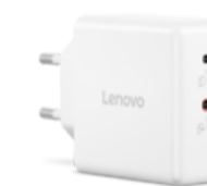
Lenovo Dual USB-C 65W GaN Charger