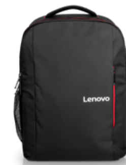
Lenovo 16" Laptop Everyday Backpack B510