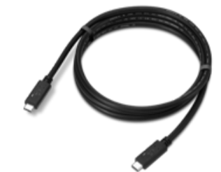
Lenovo USB 20Gbps USB-C to USB-C Cable 1.5m